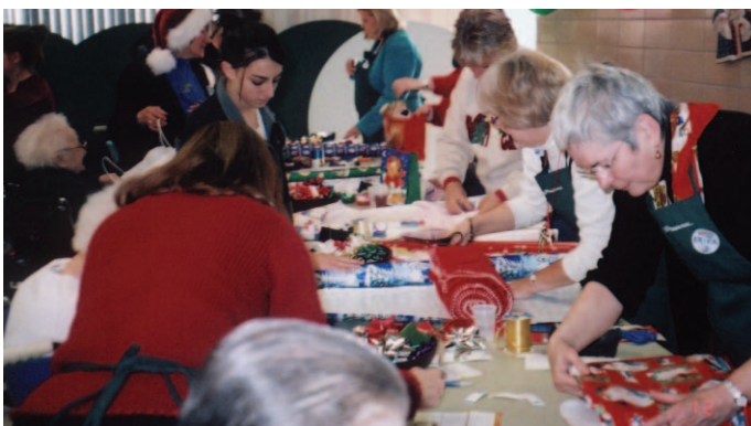
Wrapping presence, workers working hard!