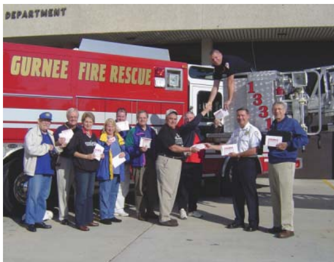
Special thanks to our File for Life workers!