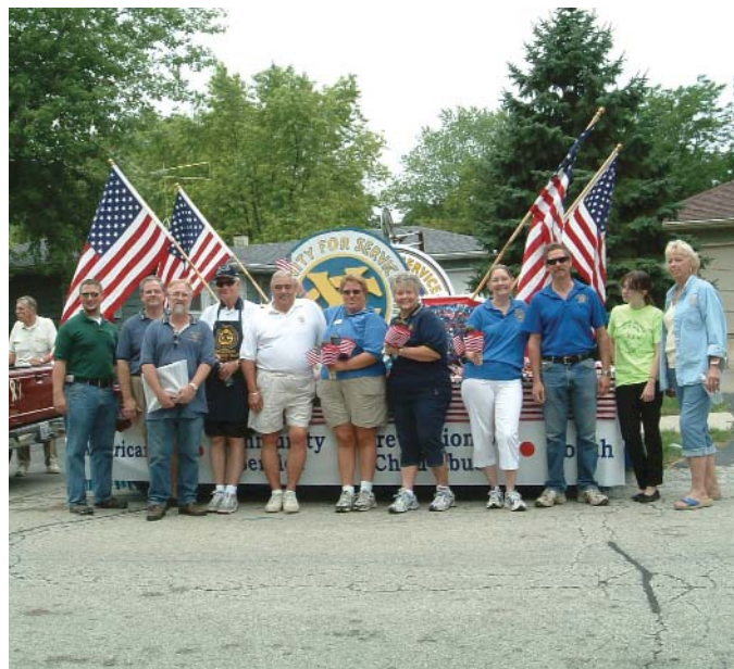
First Place for "Community Float" at the Warren Township High School Homecoming Parade!